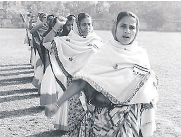
Women are more confident and aware of their rights

The purpose of microcredit loans is to make poor people aware of their latent potential and make them ready to actively participate in improving the overall development of the underprivileged people's life at the grassroots level. The Grameen Bank proved in Bangladesh and other parts of the world that if there is even a little opportunity, then the latent power of the poor and women can be explored and their capacity building increased to reach the goal of social development of their own and subsequently improving their socioeconomic, cultural and political condition in the society. Empowering women in developing countries depends upon the ownership and