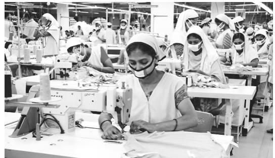
Rural women producing garments in city for export

'Over the last two decades, the scenario has changed considerably as women involved themselves in income-generating activities both within and outside home on an increasing scale. Two factors that contributed most to this transition are: the spread of microfinance endeavor of various NGOs and the expansion of the low skill export oriented textiles and garments industries.' 14 'Economic empowerment of through employment industry and access to microcredit transformed their situation. The vast majority of women in the garment industry are migrants from rural areas. This unprecedented employment opportunity for young women has narrowed gender gaps in employment and income.' 15