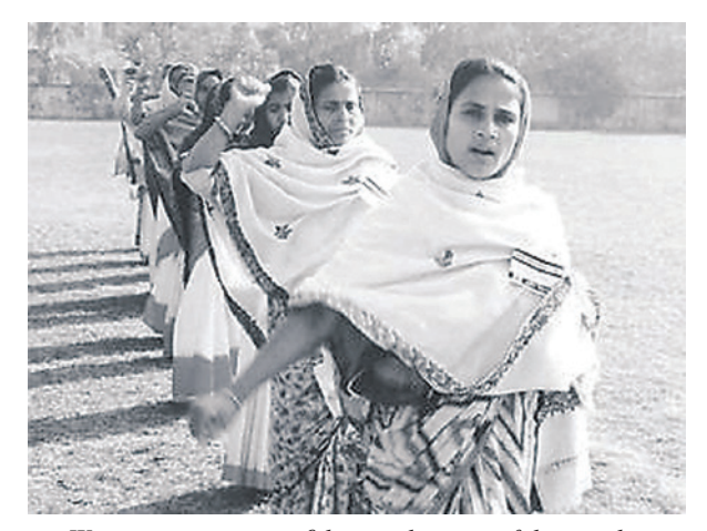
Women are more confident and aware of their rights

The purpose of microcredit loans is to make poor people aware of their latent potential and make them ready to actively participate in improving the overall development of the underprivileged people's life at the grassroots level. The Grameen Bank proved in Bangladesh and other parts of the world that if there is even a little opportunity, then the latent power of the poor and women can be explored and their capacity building increased to reach the goal of social development of their own and subsequently improving their socioeconomic, cultural and political condition in the society. Empowering women in developing countries depends upon the ownership and